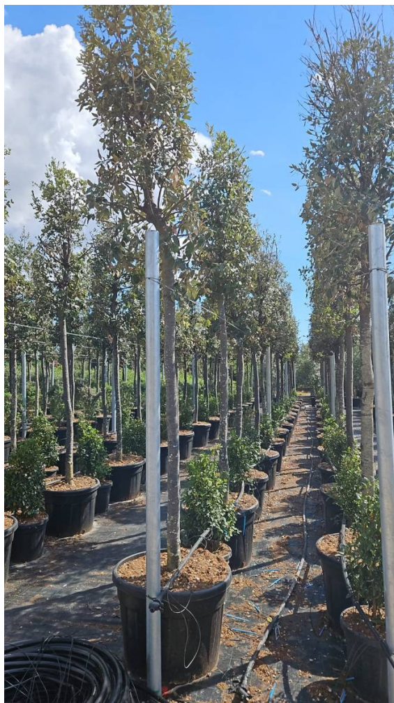
QUERCUS ILEX POT - Circ: 20-25 Vaso: 130 Lt - Shape: Std