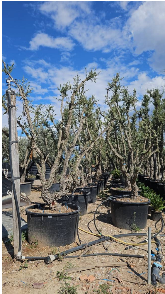
QUERCUS SUBER (Sughera) POT - Alt: 350/400 Vaso: 600 Lt - Shape: Multistem