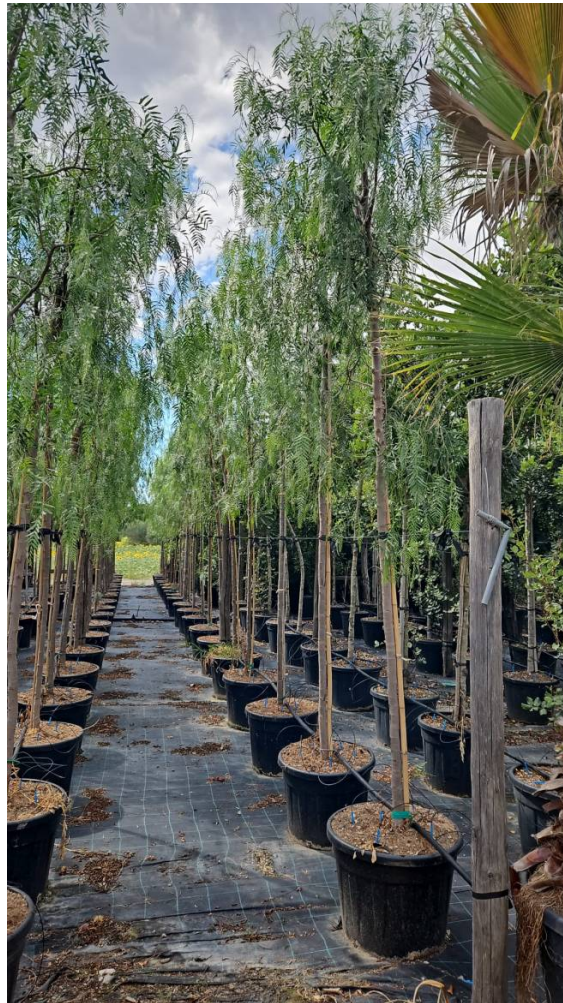
SCHINUS MOLLE POT - Circ: 12-14 Vaso: 90 Lt - Shape: Std