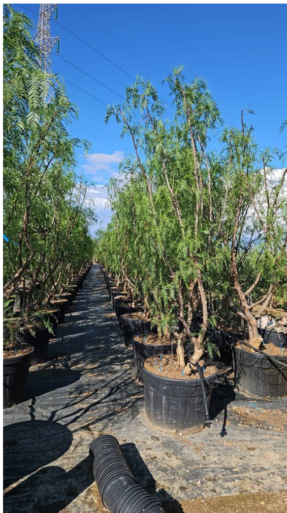
SCHINUS MOLLE POT - Alt: 350/400 Vaso: 180 Lt