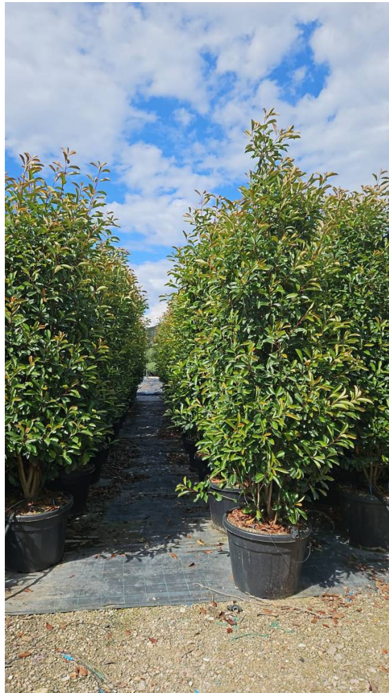
PHOTINIA x FRASERI "Red Robin" POT - Alt: 300/350 Vaso: 110 Lt - Stock