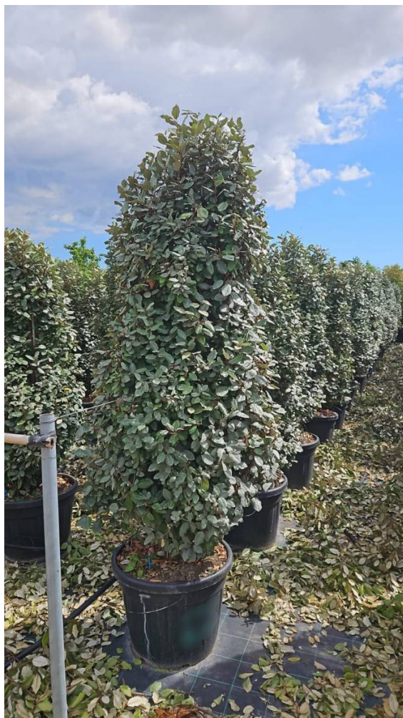
ELAEAGNUS EBBINGEI POT - Alt: 200/250 Vaso: 90 Lt - Stock