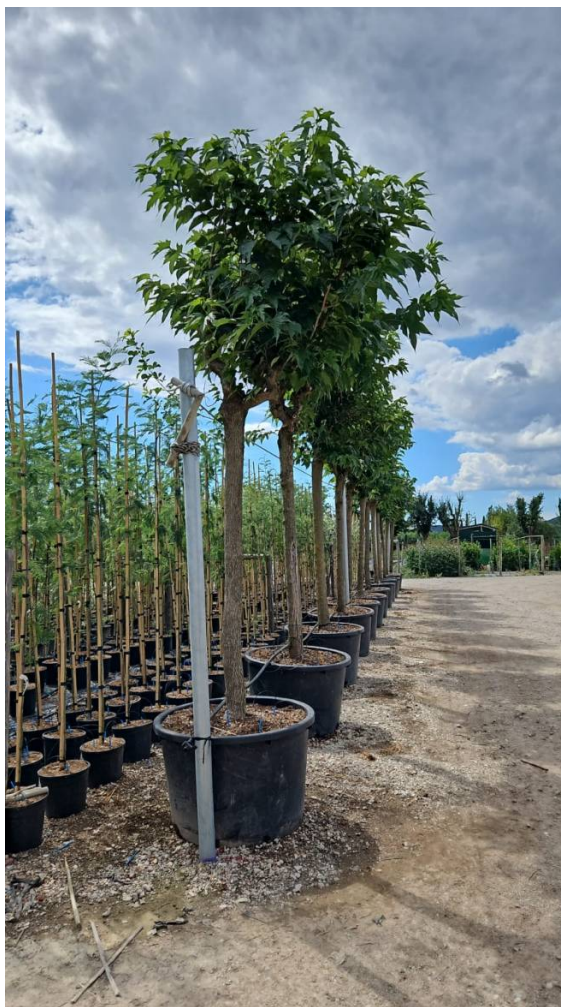
MORUS KAGAYAMAE POT - Circ: 30-40 Vaso: 375 Lt - Shape: Std - Price: Eur 9,50 x cm (trunk circumference)