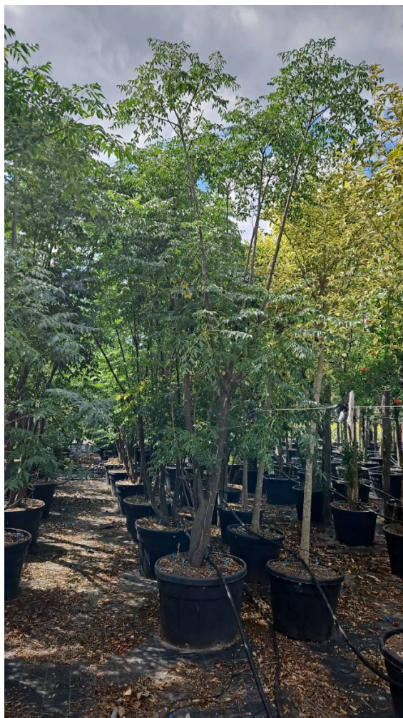
MELIA AZEDARACH POT - Alt: 400/450 Vaso: 180 Lt - Shape: Multistem