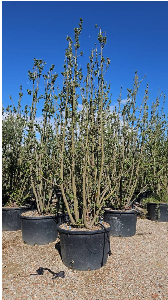
QUERCUS ILEX POT - Alt: 450/500 Vaso: 450 Lt - Shape: Multistem