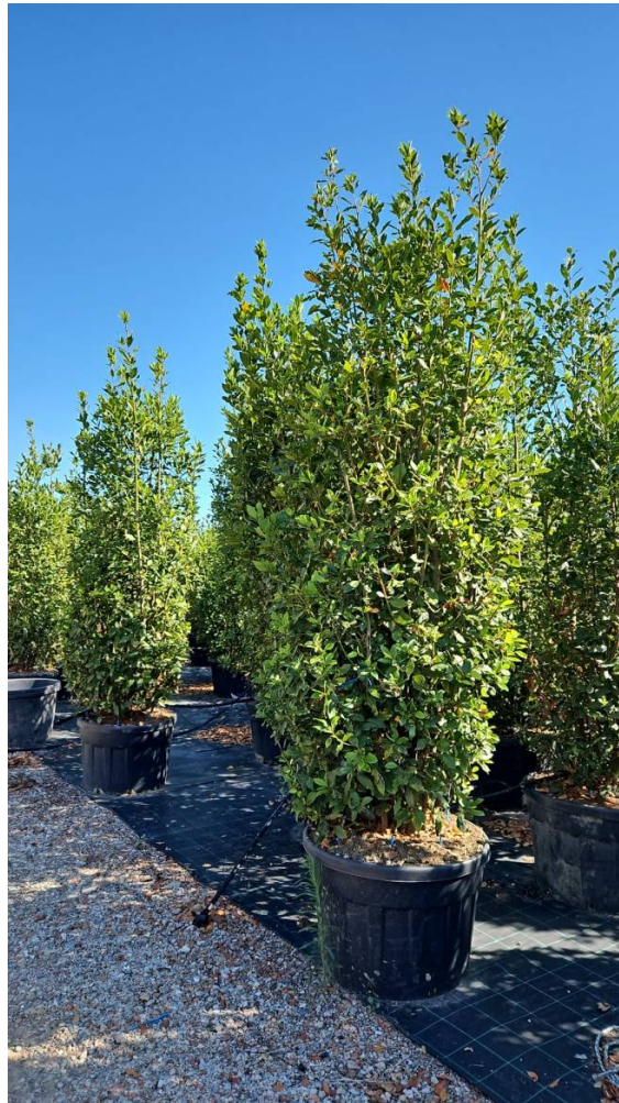
LAURUS NOBILIS (Alloro) POT - Alt: 350/400 Vaso: 180 Lt