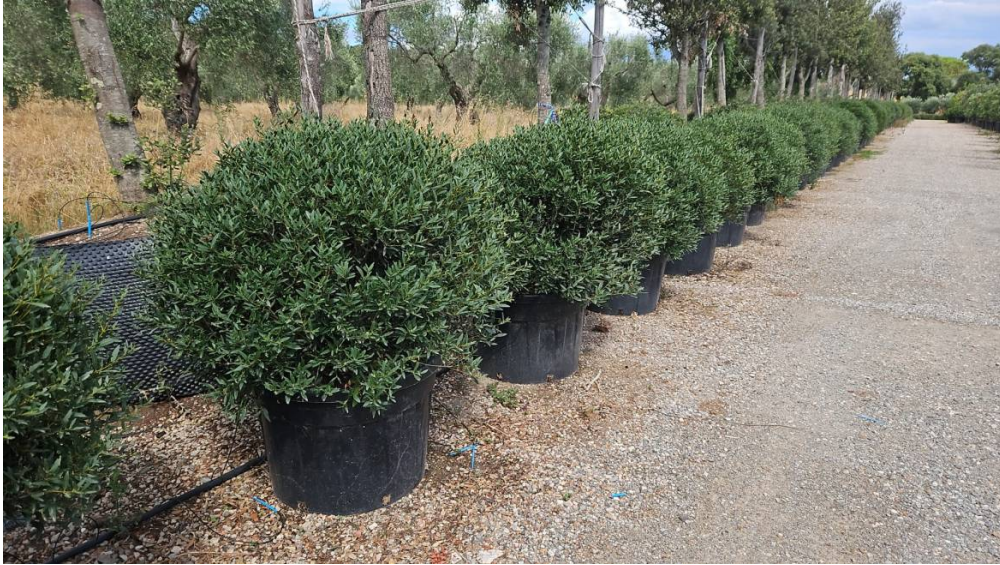
PHYLLIREA ANGUSTIFOLIA POT - Diam: 120-140 Vaso: 150 Lt - Shape: Ball