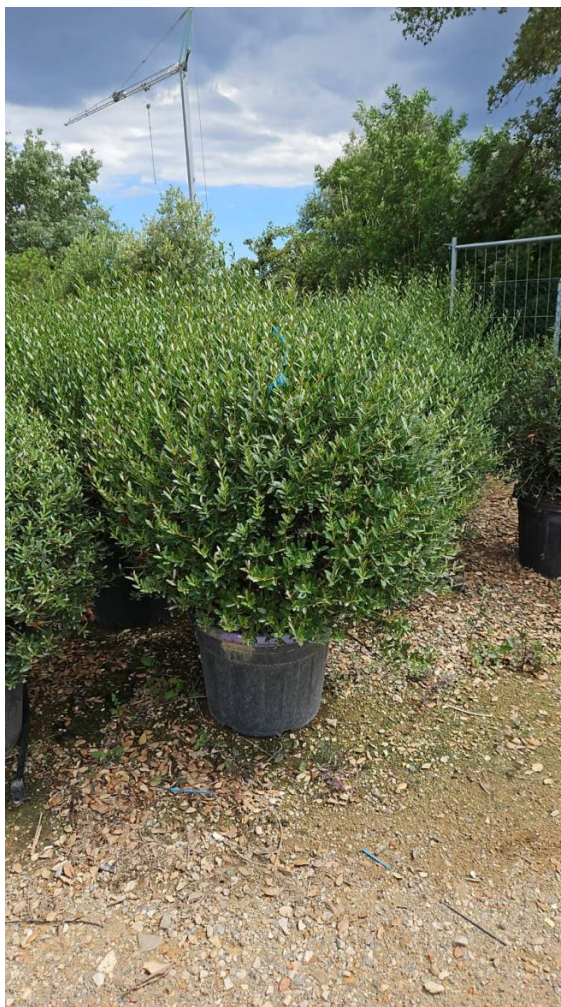
PHYLLIREA ANGUSTIFOLIA POT - Diam: 100-120 Vaso: 70 Lt - Shape: Ball