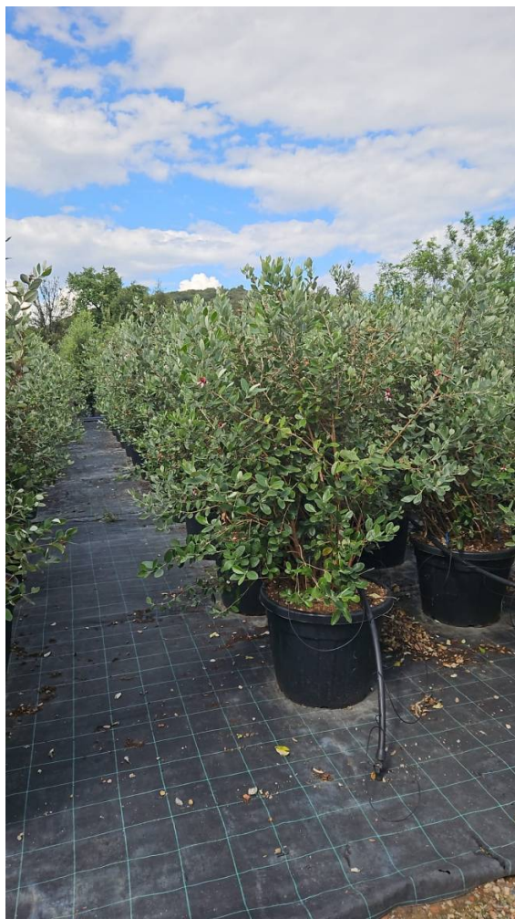
FEIJOA SELLOWIANA POT - Alt: 200/250 Vaso: 90 Lt