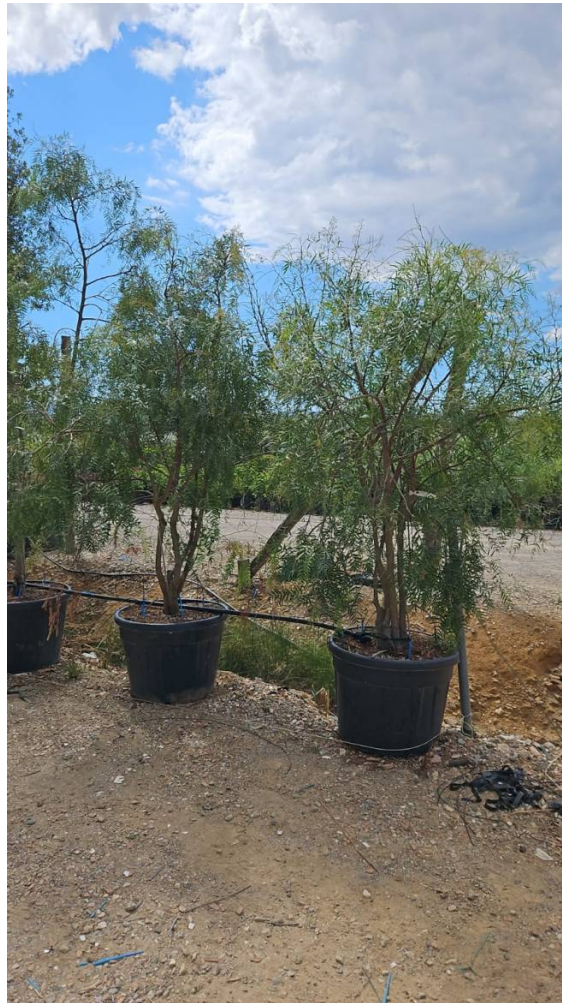
SCHINUS MOLLE POT - Alt: 300/350 Vaso: 110 Lt - Shape: Multistem