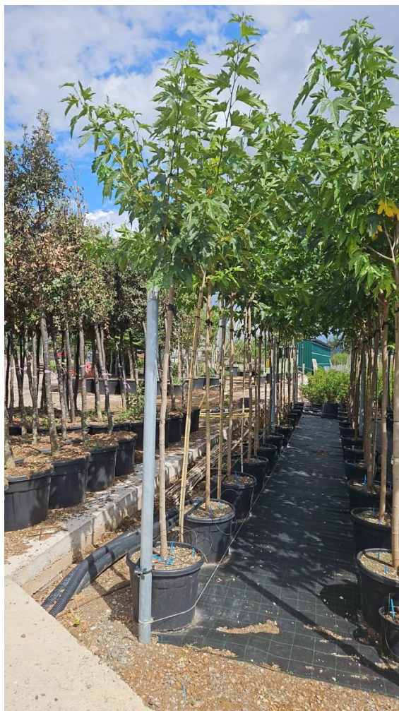
MORUS (gelso) Fruitless POT - Circ: 14-16 Vaso: 90 Lt - Shape: Std