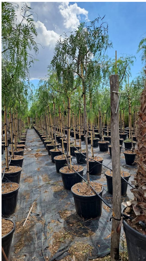
SCHINUS MOLLE POT - Circ: 10-12 Vaso: 90 Lt - Shape: Std