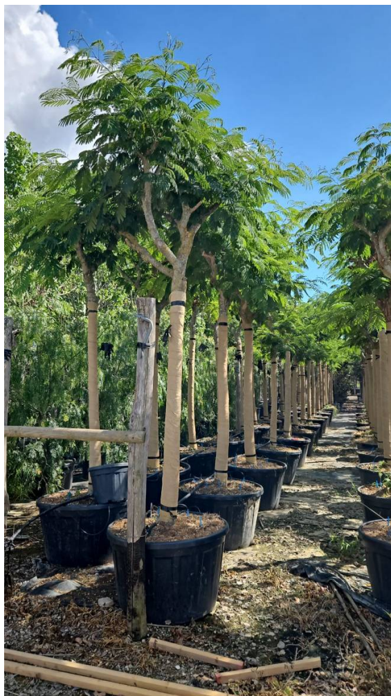
ALBIZIA JULIBRISSIN POT - Circ: 30-35 Vaso: 290 Lt - Shape: Std