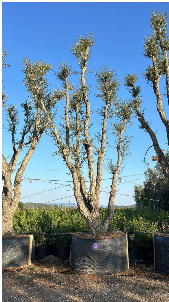
QUERCUS SUBER (Sughera) AIRPOT - - Shape: Solitair - Cataloged by purple color