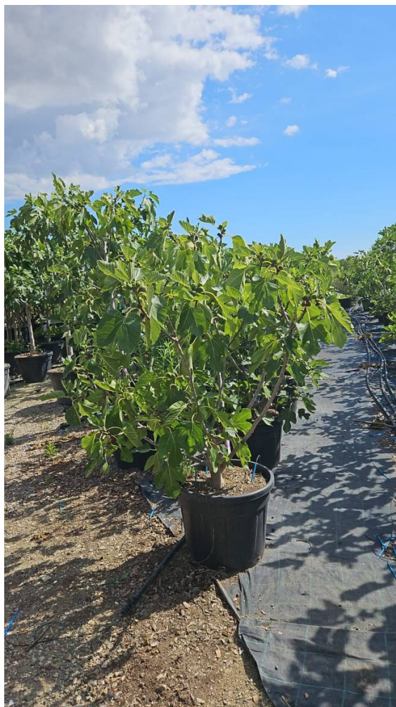
FICUS CARICA (Fico) POT - Alt: 180/200 Vaso: 90 Lt - Shape: Multistem