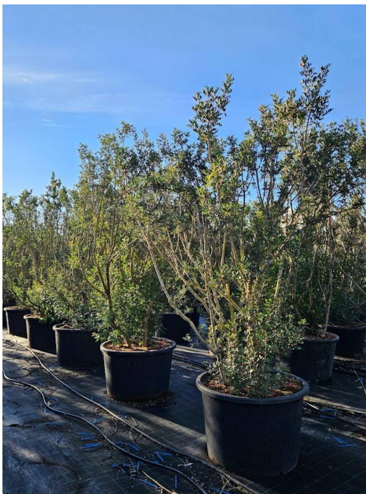
PISTACIA LENTISCUS POT - Alt: 200/250 Vaso: 180 Lt