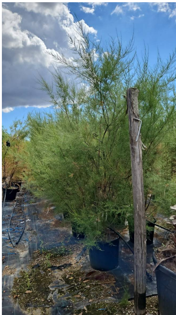
TAMARIX GALLICA POT - Alt: 300/350 Vaso: 70 Lt