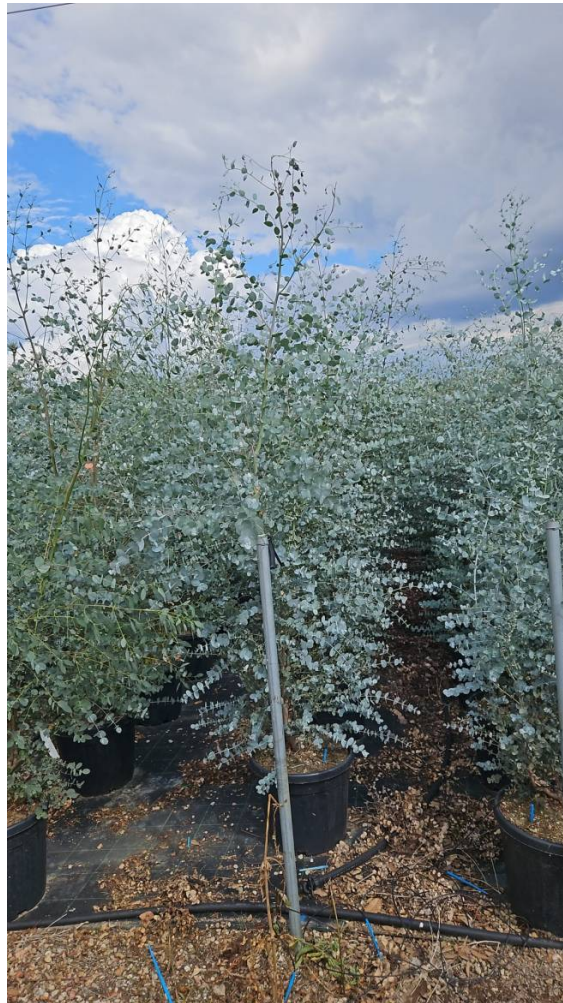
EUCALYPTUS GUNNII POT - Alt: 250/300 Vaso: 30 Lt - Shape: Multistem