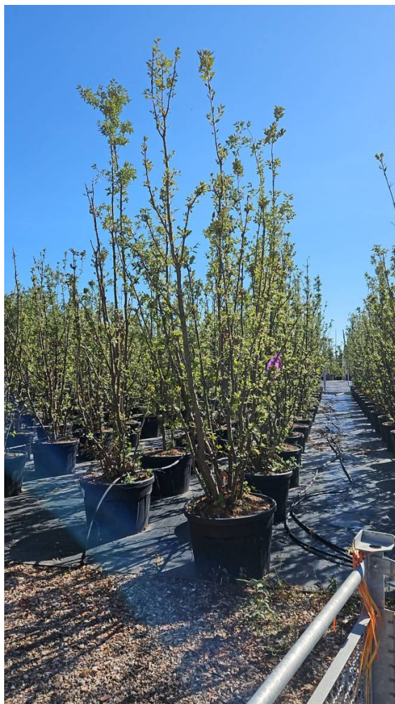
QUERCUS ILEX POT - Alt: 300/350 Vaso: 180 Lt - Shape: Multistem