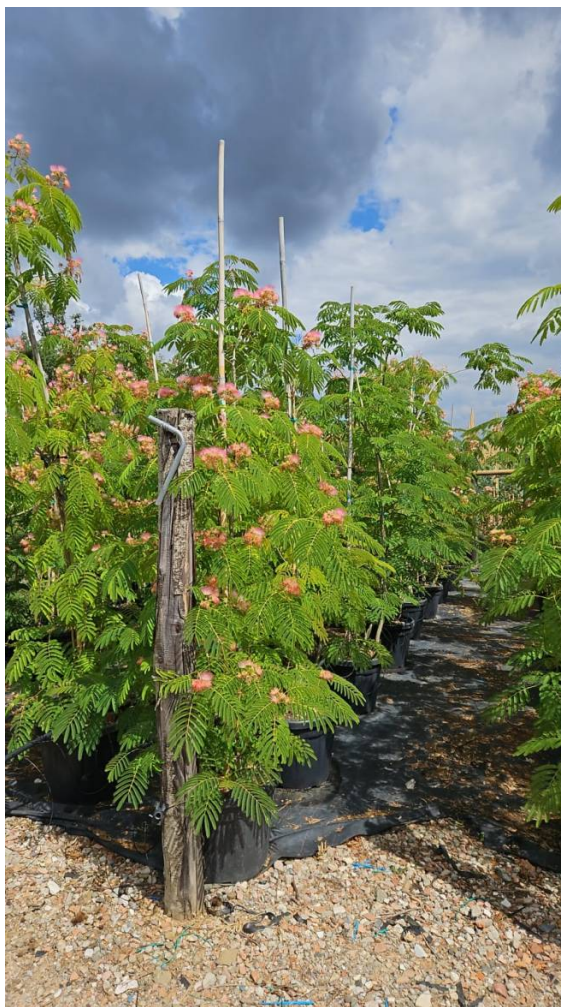
ALBIZIA JULIBRISSIN POT - Alt: 300/350 Vaso: 55 Lt - Shape: Multistem