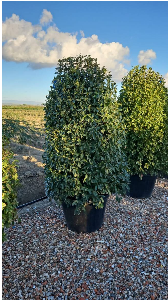
VIBURNUM TINUS POT - Alt: 120/150 Vaso: 110 Lt