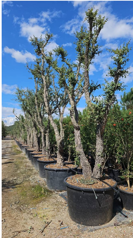
QUERCUS SUBER (Sughera) POT - Alt: 400/+ Vaso: 450 Lt - Shape: Multistem