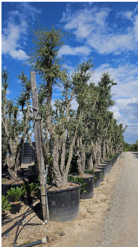
QUERCUS SUBER (Sughera) POT - Alt: 500/+ Vaso: 750 Lt - Shape: Multistem