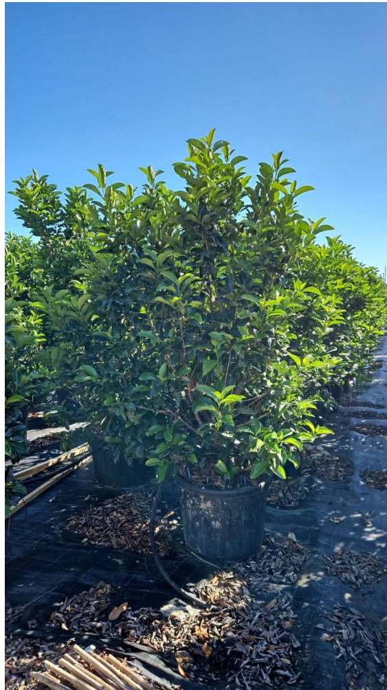
VIBURNUM LUCIDUM POT - Alt: 250/300 Vaso: 130 Lt