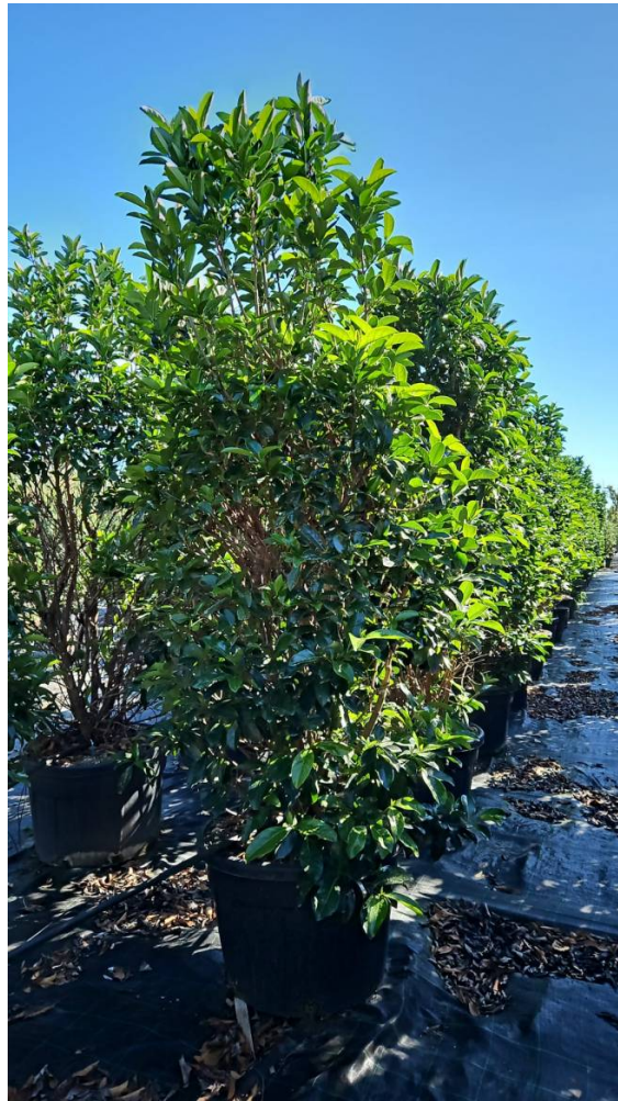
VIBURNUM LUCIDUM POT - Alt: 300/350 Vaso: 150 Lt