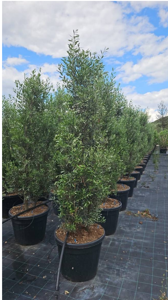
OLEA EUROPEA CIPRESSINO POT - Alt: 250/300 Vaso: 90 Lt