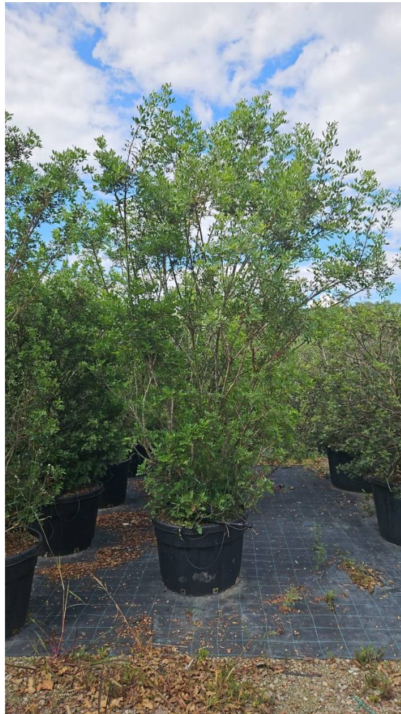
PISTACIA LENTISCUS POT - Alt: 300/350 Vaso: 180 Lt