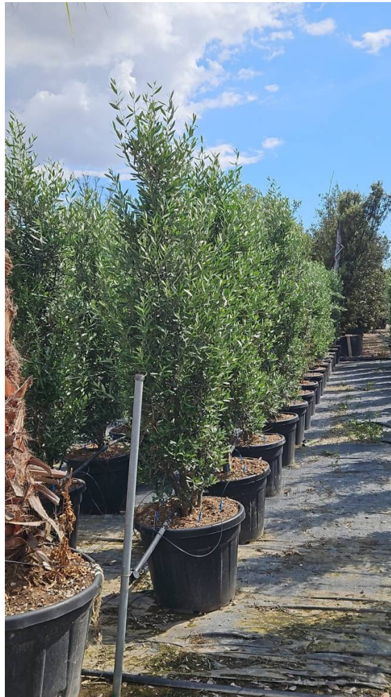
OLEA EUROPEA CIPRESSINO POT - Alt: 300/350 Vaso: 110 Lt