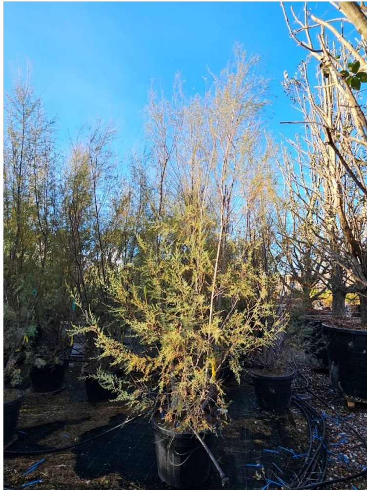
TAMARIX AFRICANA POT - Alt: 350/400 Vaso: 130 Lt