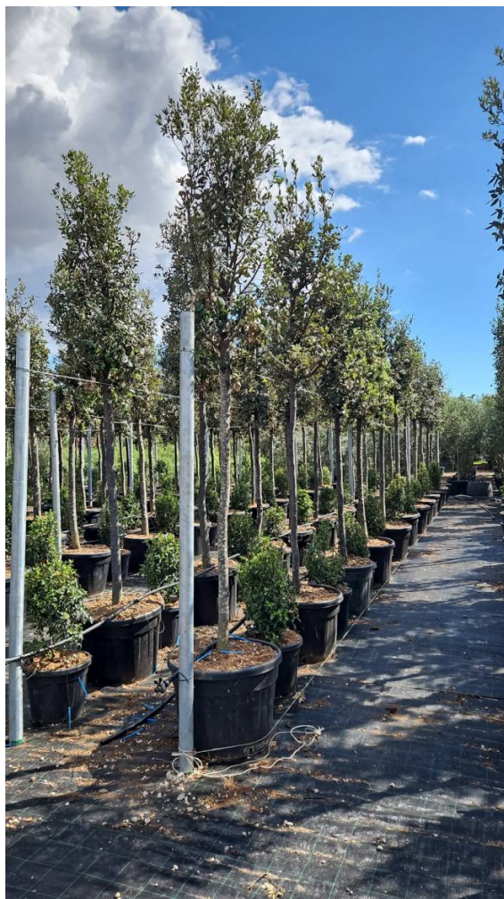
QUERCUS ILEX POT - Circ: 18-20 Vaso: 130 Lt - Shape: Std