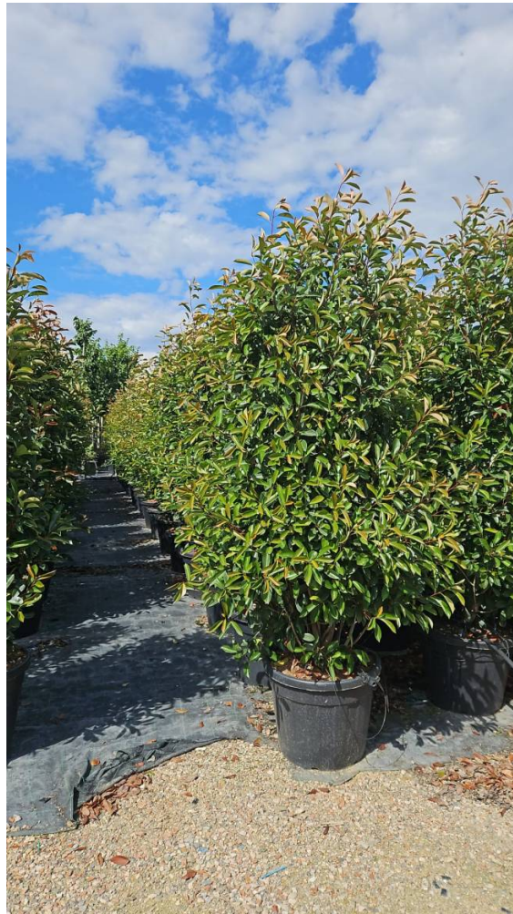
PHOTINIA x FRASERI "Red Robin" POT - Alt: 250/+ Vaso: 90 Lt