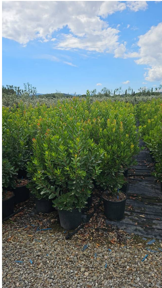
ARBUTUS UNEDO POT - Alt: 120/150 Vaso: 18 Lt