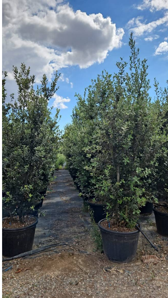
QUERCUS ILEX POT - Alt: 300/350 Vaso: 130 Lt - Shape: Multistem