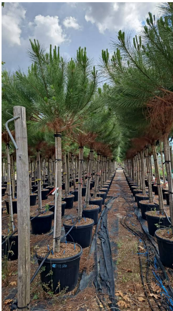
PINUS PINEA POT - Circ: 20-25 Vaso: 110 Lt - Shape: Std