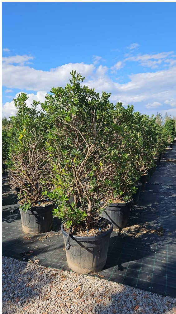
PITTOSPORUM TOBIRA POT - Alt: 200/250 Vaso: 110 Lt