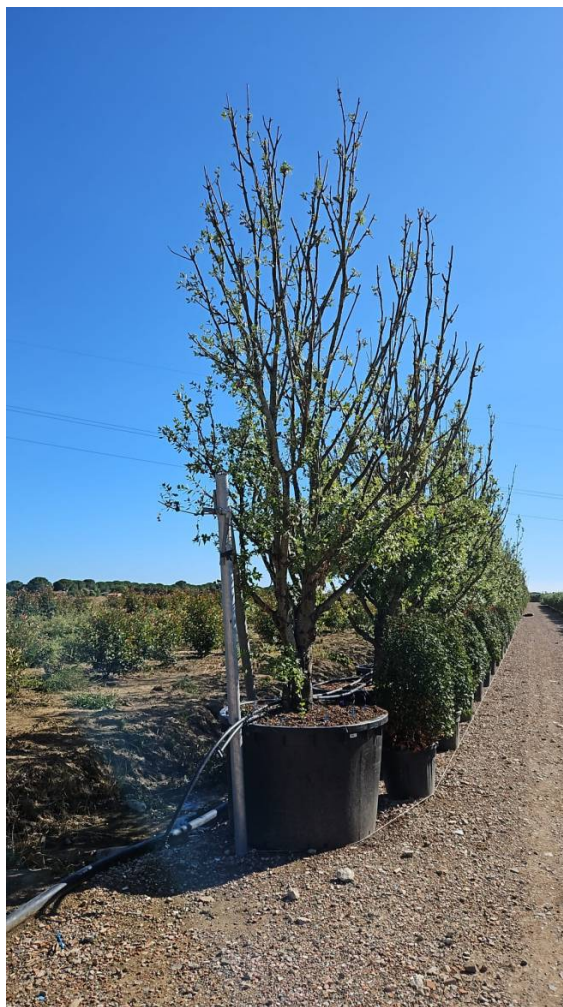
QUERCUS ILEX POT - Alt: 500/600 Circ: 40-50 Alt: 40 Vaso: 1000 Lt - Shape: Multistem on 40 cm trunk