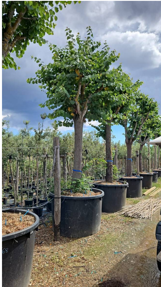
CERCIS SILIQUASTRUM POT - Circ: 60-70 Vaso: 1000 Lt - Shape: Std - Price: Eur 9,50 x cm (trunk circumference)