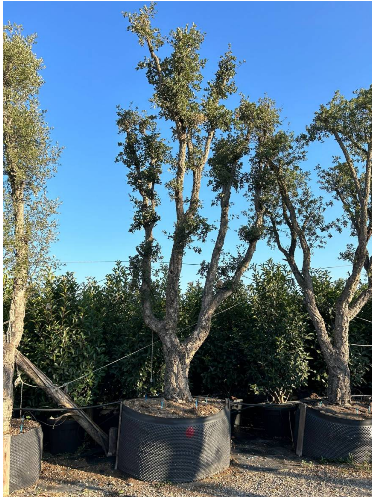
QUERCUS SUBER (Sughera) AIRPOT - - Shape: Solitair - Cataloged by red color