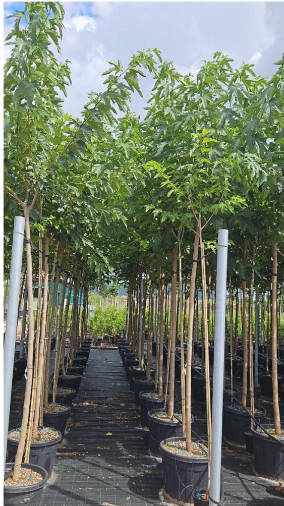
MORUS (gelso) Fruitless POT - Circ: 14-16 Vaso: 110 Lt - Shape: Std