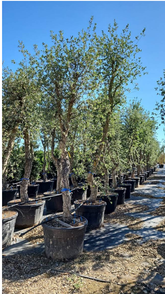
QUERCUS SUBER (Sughera) POT - Alt: 300/350 Vaso: 230 Lt - Characterized subjects