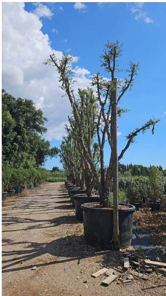
QUERCUS SUBER (Sughera) POT - Alt: 450/500 Vaso: 1000 Lt - Shape: Multistem