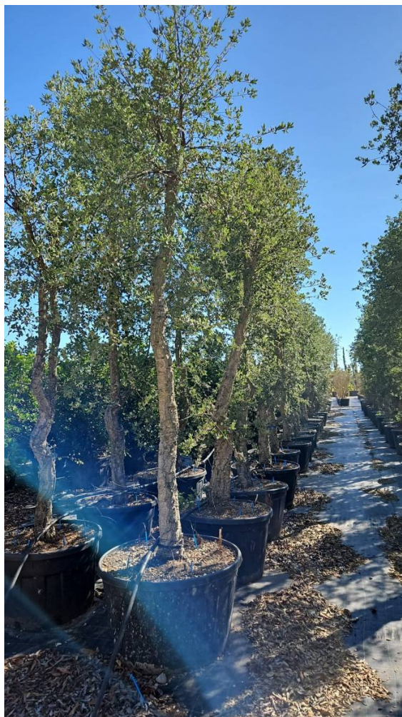
QUERCUS SUBER (Sughera) POT - Alt: 350/400 Vaso: 290 Lt - Characterized subjects