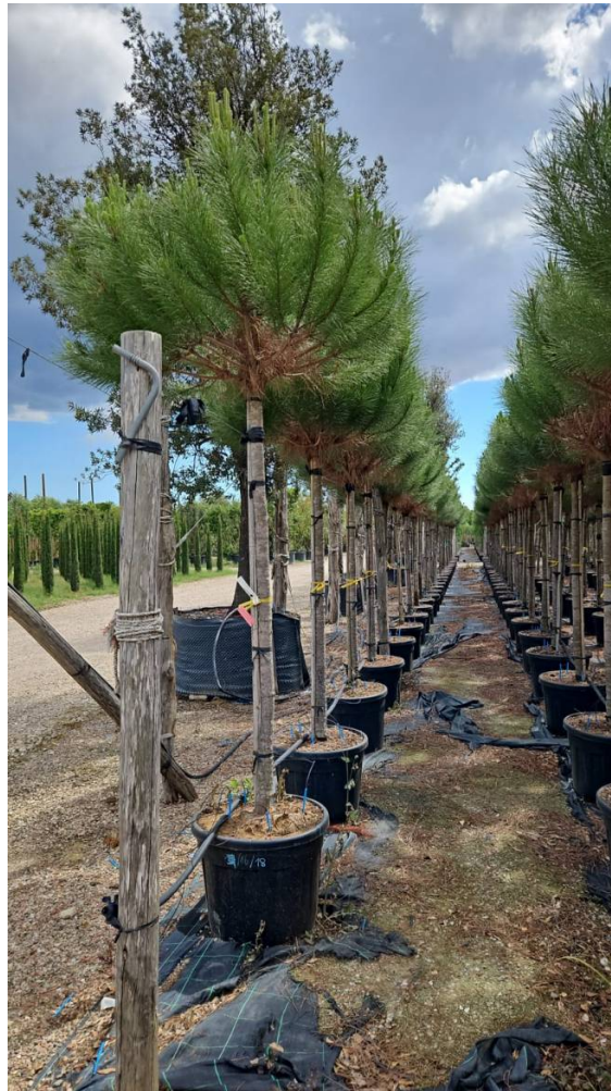
PINUS PINEA POT - Circ: 18-20 Vaso: 90 Lt - Shape: Std