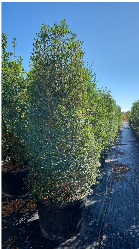
PHYLLIREA ANGUSTIFOLIA POT - Alt: 250/300 Vaso: 180 Lt