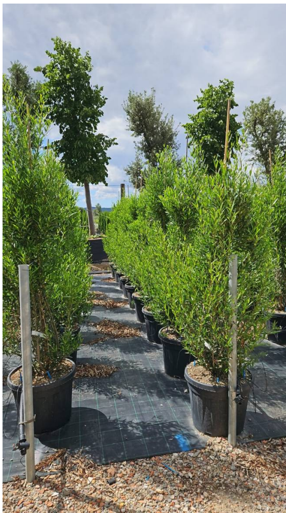
PHYLLIREA ANGUSTIFOLIA POT - Alt: 200/250 Vaso: 45 Lt