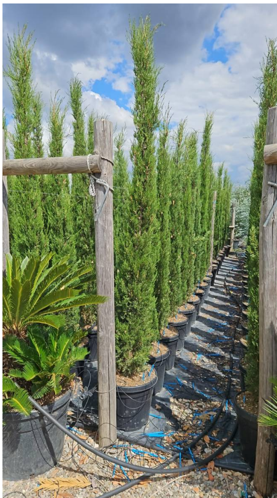
CUPRESSUS SEMPERVIRENS POT - Alt: 300/350 Vaso: 45 Lt