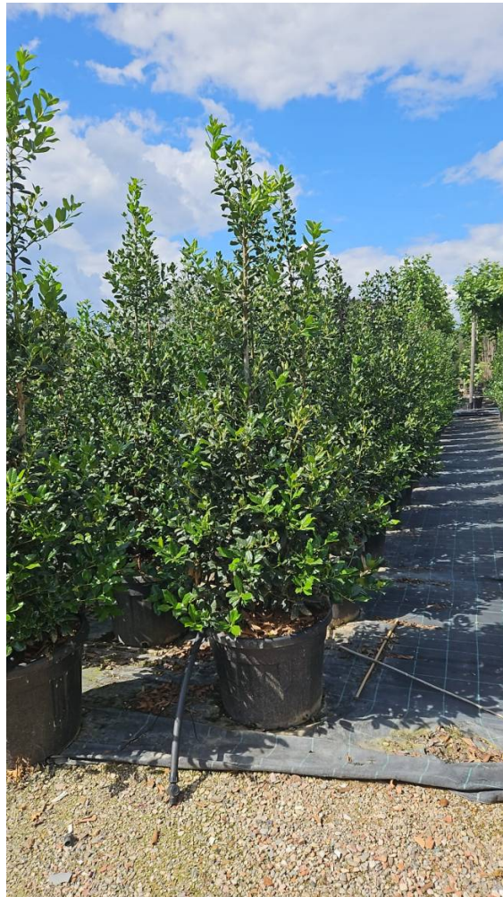
ILEX NELLIE STEVENS POT - Alt: 200/250 Vaso: 110 Lt