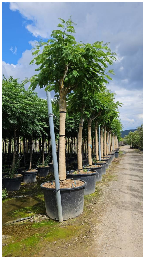
ALBIZIA JULIBRISSIN POT - Circ: 40-50 Vaso: 450 Lt - Shape: Std - Price: Eur 9,50 x cm (trunk circumference)