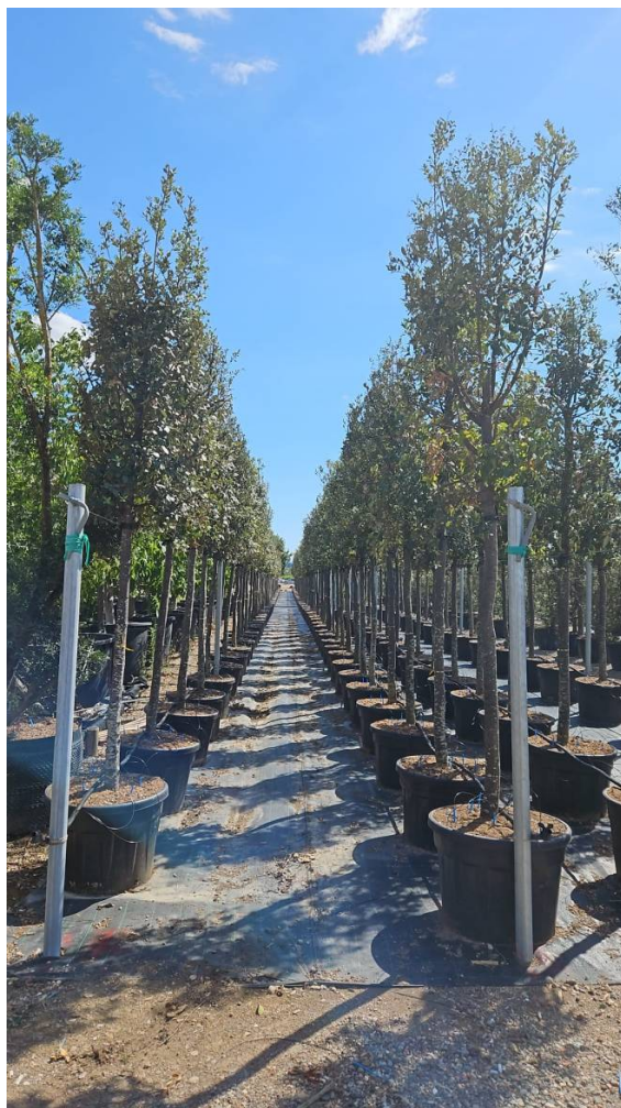
QUERCUS ILEX POT - Circ: 20-25 Vaso: 150 Lt - Shape: Multistem, Std