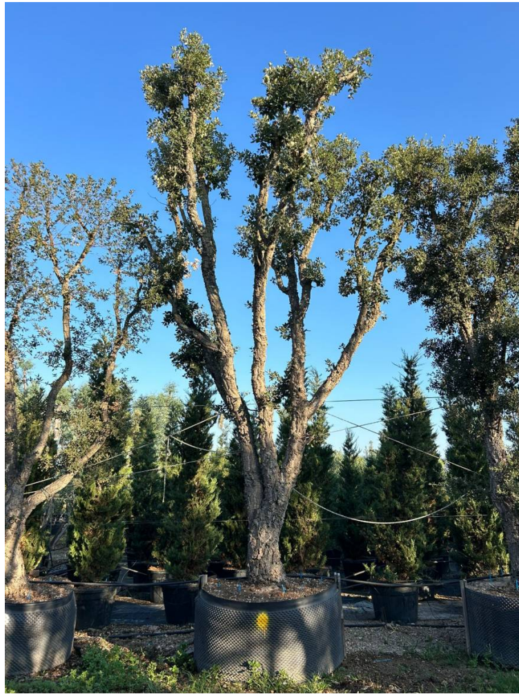
QUERCUS SUBER (Sughera) AIRPOT - - Shape: Solitair - Cataloged by yellow color