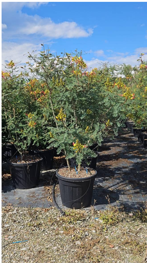
CAESALPINA GILLIESSII POT - Alt: 200/250 Vaso: 90 Lt - Shape: Multistem