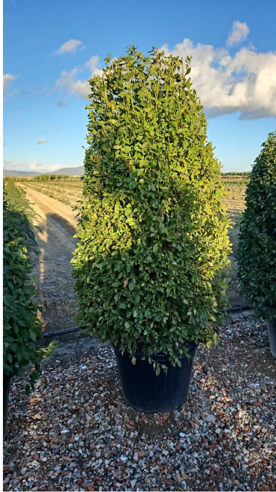
VIBURNUM TINUS POT - Alt: 150/+ Vaso: 110 Lt